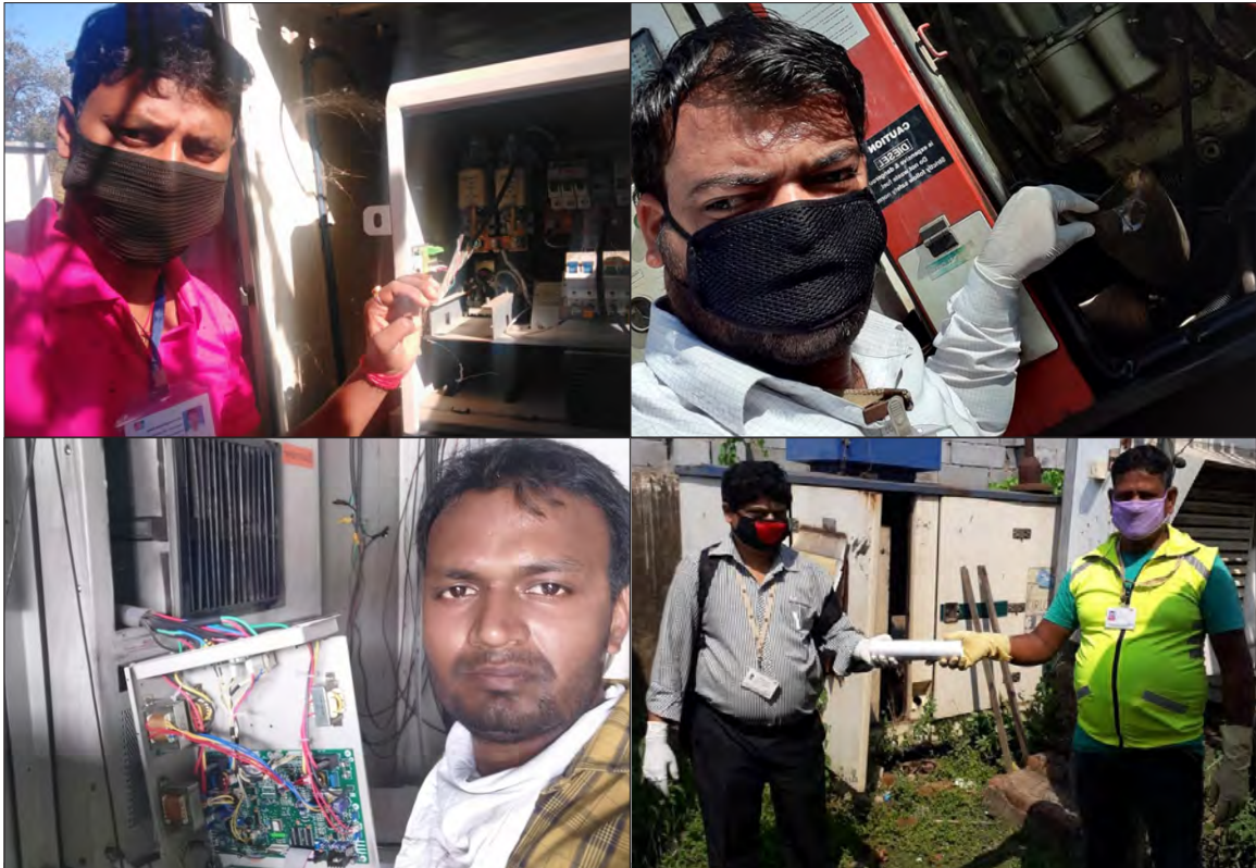
Best in Class O&M of Telecom Infrastructure.

All efforts were directed towards ensuring operational excellence in order to deliver good network uptime to its customer and in particular to the general public at large.